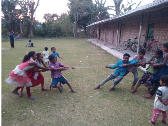
Recreation time After School Club

been involved in this process and could able to make success with the achievement of Adult Literacy and Child Development project (After School Club). On behalf of DCDP I would like to offer our thankfulness to all for their active participation and concluded here the short report.