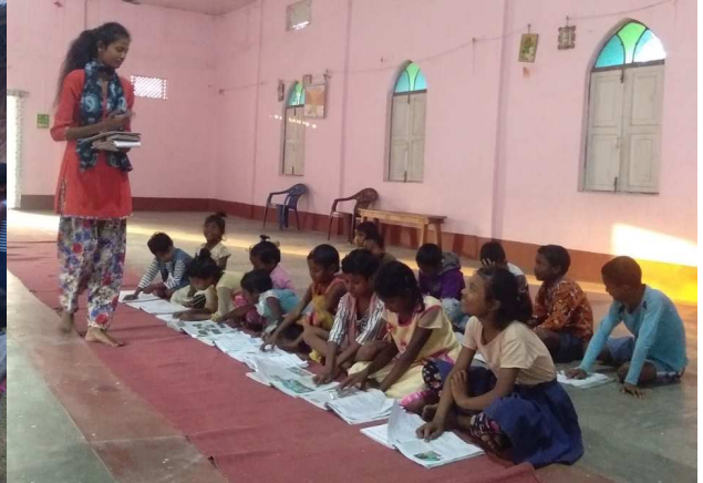
STUDY HOUR of After School Club