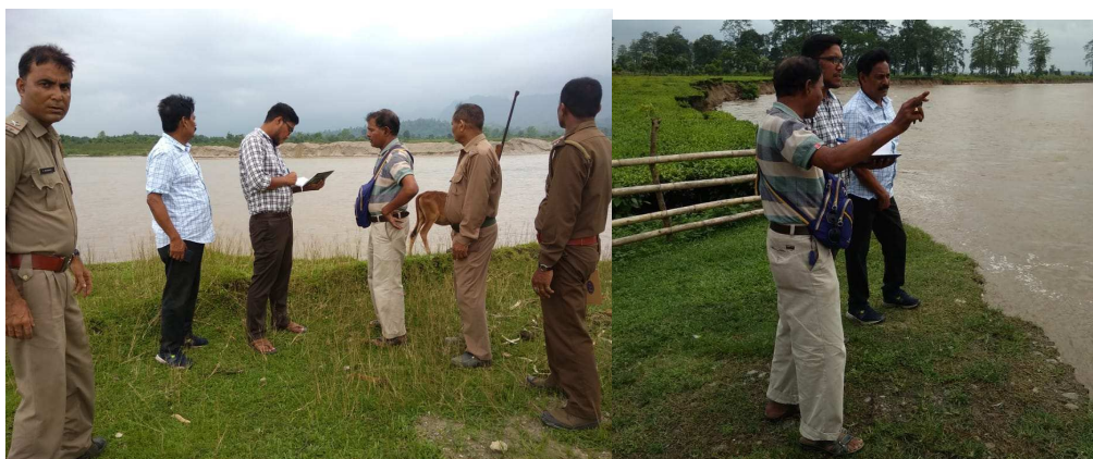
Visited to Boroi Land Slide along Range Officer- Borgang and Circle Officer, Helem Revenue Circle