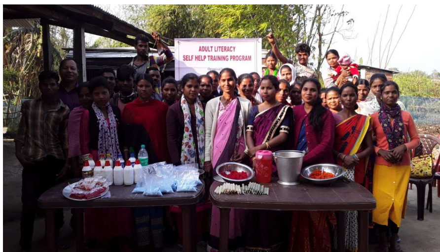
SELF HELP TRAINING PROGRAMME